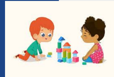
Social skills and having fun!