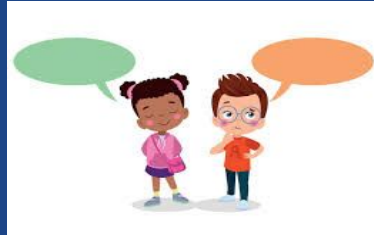
Speech and Language